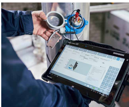
Field Xpert SMT70 offers many useful features

The Field Xpert SMT70 software is intelligent and powerful. “With this we now have a beautiful mobile platform that will allow us to move forward for a few years to come,” says the E&I responsible. “In addition to the enormous ease of use, the new tablets are much faster. They connect very quickly to the instruments, which you can immediately check for correct operation. If you change the parameter settings ‘in the field’, a new PDF will be created immediately. If you put the tablet in the docking station when you return to the office, the PDF is automatically placed on the server so that the instrument data is always up to date. This is also a great advantage when replacing instruments. We now have three Field Xpert SMT70 tablets in use and are still discovering new useful features. Everyone in the department likes to work with them.”